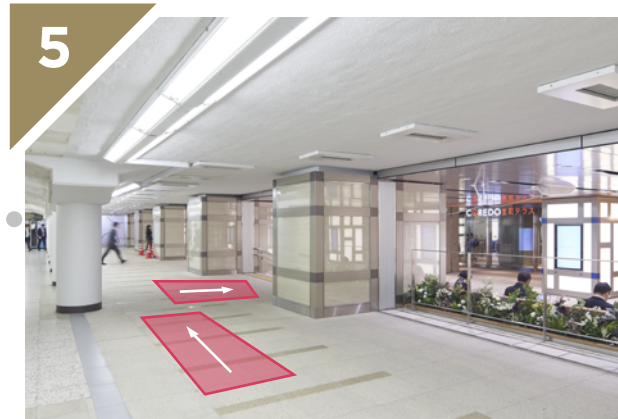
At this point just before Mitsukoshimae Station, turn right.