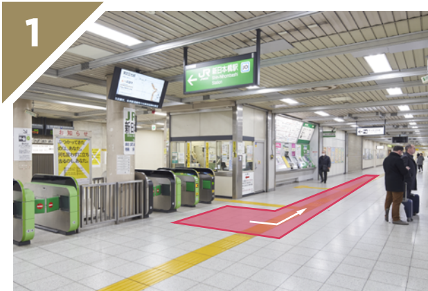
After exiting the ticket gate, head left.