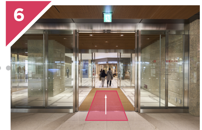
COREDO Muromachi Terrace will be straight ahead.