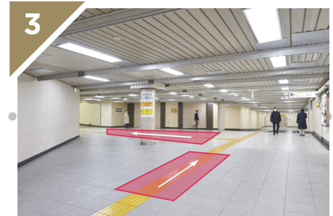
At this three-way intersection, turn left.