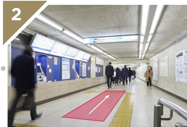
Continue straight ahead, past the ticket window on your left.