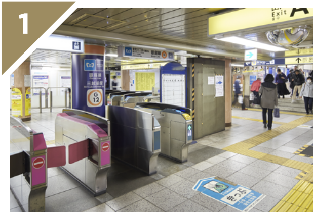
Exit via Muromachi 3-chome Gate, and head in the direction of Shin-Nihonbashi Station.