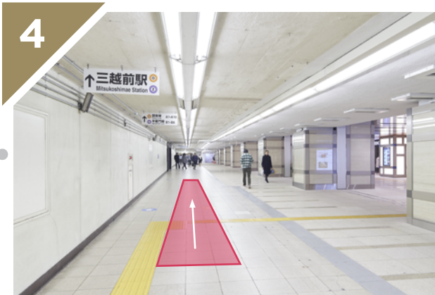
Continue in the direction of Mitsukoshimae Station.