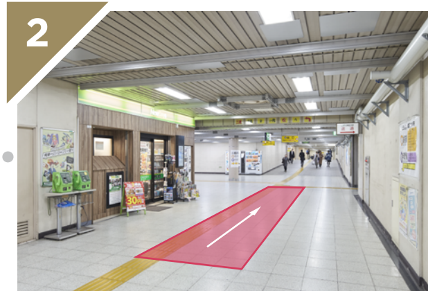
Continue straight ahead, past the NewDays on your left.